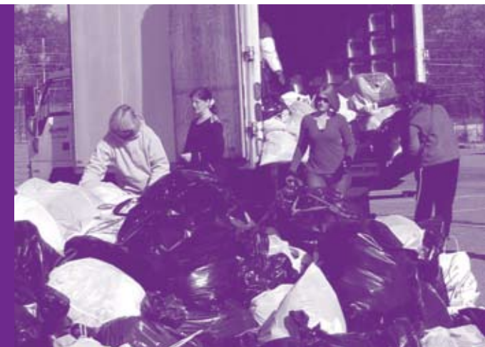
More than 100 car loads of textile donations were dropped off at the J&J drop-off site in Morris Plains, NJ, where volunteers were waiting to lift the bags onto the trucks from the "Friends" fundraising group.