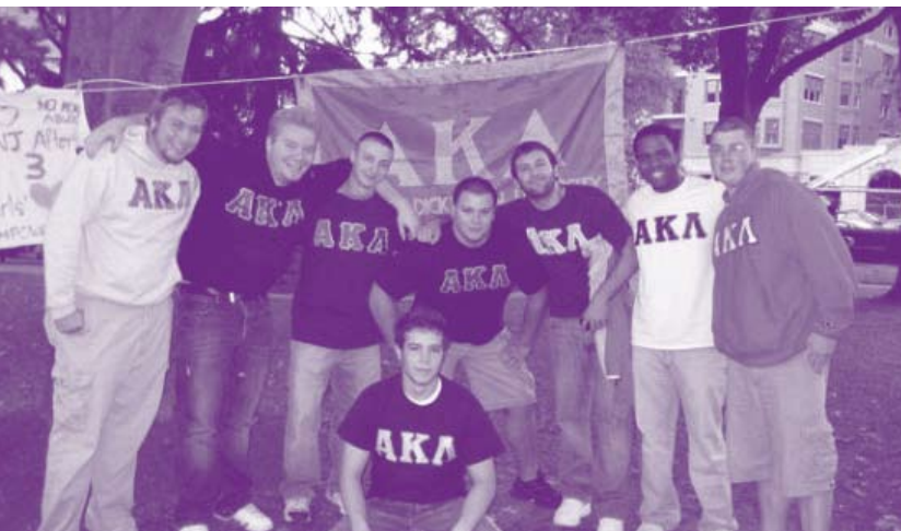
Members of the Alpha Kappa Lambda fraternity at FDU were among the dozen youth groups that participated in the 4th Annual Candlelight Vigil to shed light on the problem of domestic violence in Morris County.